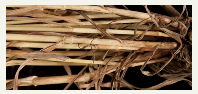
Bromus commutatus Hairless spikelets

Hairless lower leaf sheaths (a useful indicator BUT about 50% of populations have hairy lower leaf sheaths)