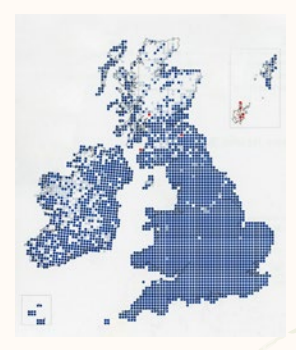
Bromus hordeaceus – soft brome Very common throughout the UK. (85%). Most commonly found in grassland, field margins, waste ground and roadside verges, but does occur in arable fields too.