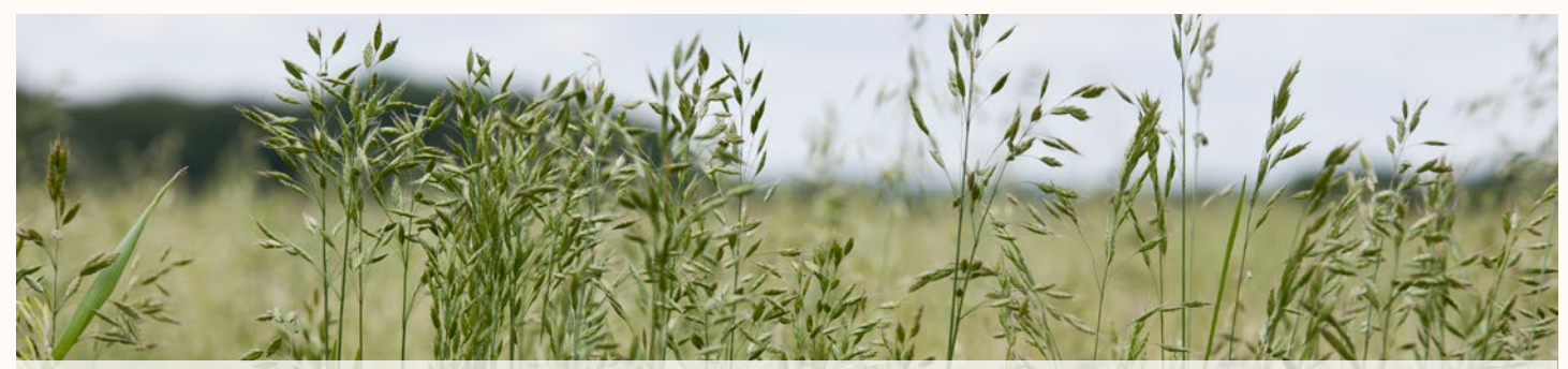
Bromes are some of the most competitive grass-weed species with similar competitive abilities to wild-oats and Italian rye-grass and more competitive than black-grass.

New Flora of the British Isles (3rd edition). (2010). By Clive Stace. Cambridge University Press, Cambridge. 1232 pp. Grasses, Sedges, Rushes and Ferns of the British Isles and North-Western Europe. (1989). By Francis Rose. Penguin Group, London. 240 pp.