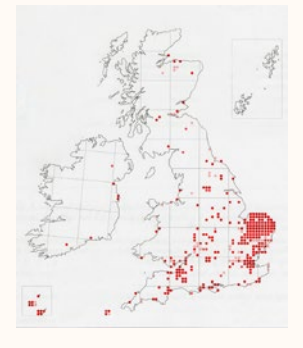
Bromus diandrus – great brome Mainly recorded in East Anglia but scattered throughout the rest of England. (11%). Probably underrecorded due to confusion with B. sterilis .