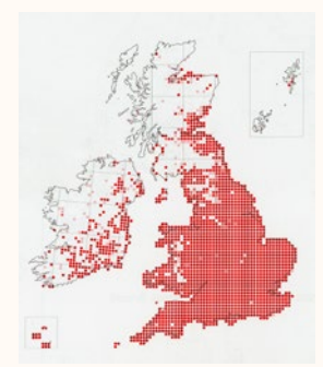
Bromus sterilis – sterile or barren brome Very common throughout England and Wales, more scattered in Scotland. (65%). Very common in field margins and hedgerows as well as within arable fields.

In the UK, there are five main species which frequently occur as weeds of arable crops. Their relative frequencies, as reported in the Atlas of the British Flora (2002), are given as the (%) of the 2852 10 x 10 km grid squares surveyed in which the species was detected. See maps. Blue = Native species; Red = Introduced species.