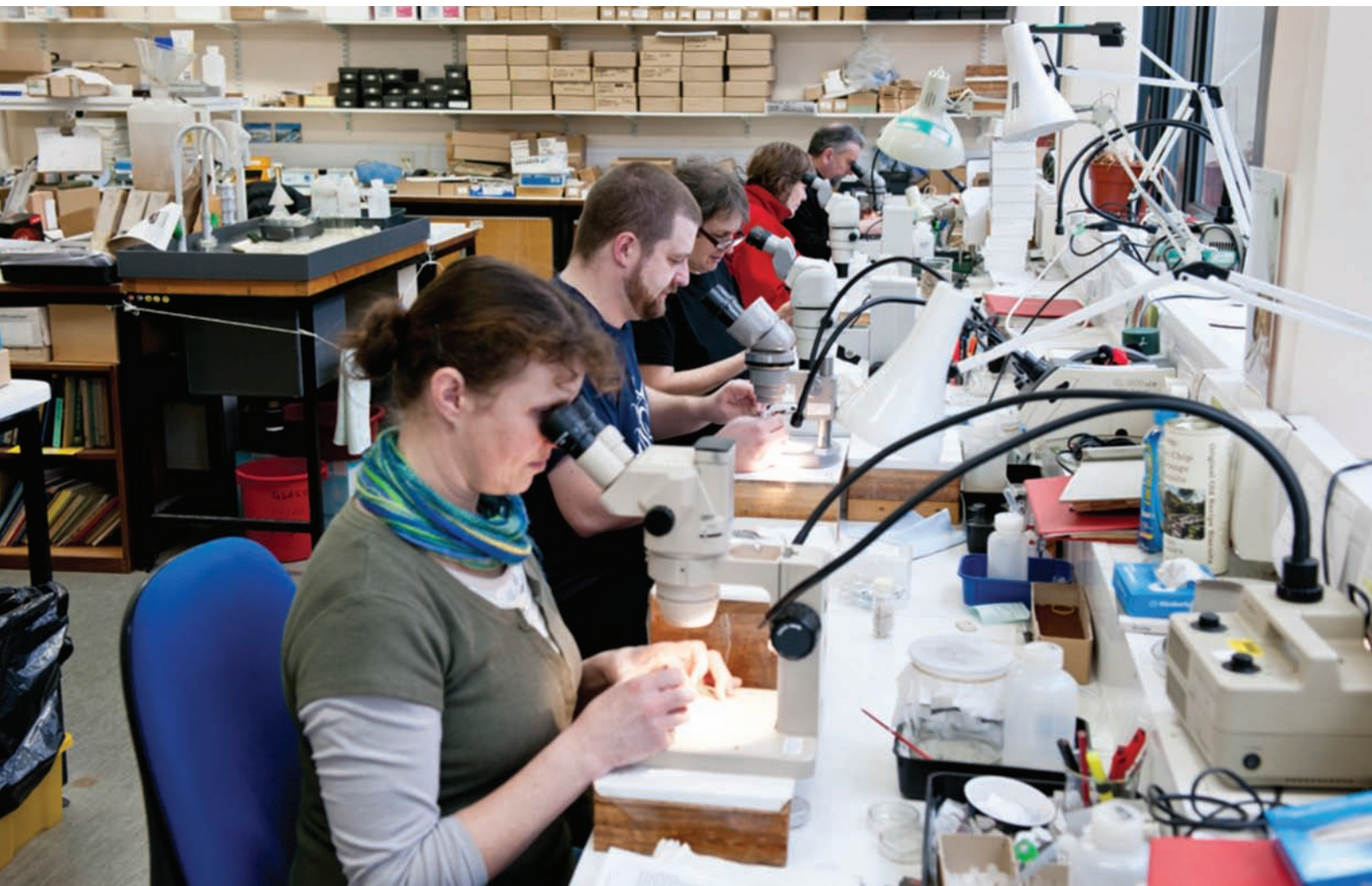
The Survey Team (above) and at work (below)