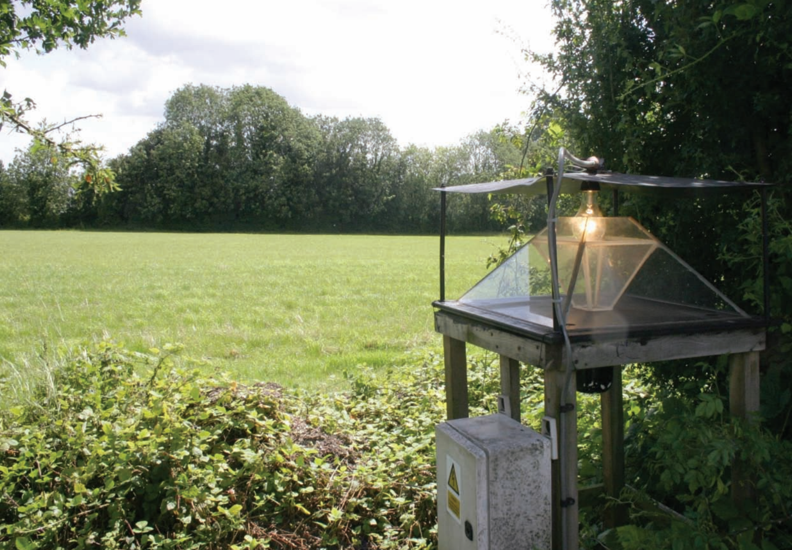
Barnfield light trap